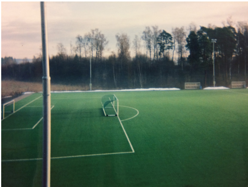
Fig. 1. Football field outside the classroom window (source: Sobia, age 14 years).

Nevertheless, even participating in unorganized activities entailed challenges to be overcome, which can be illustrated by Sobia's photo, shown in Figure 1. Sobia attended a preparatory class and often played football in the field during school hours, but never during after-school hours when she mostly spent time at home with her family. She explained that this was what she had always been used to, underscoring the effort it takes to create new routines in a new place with differing norms and expectations of (gendered) youth behaviour. Sobia had taken the photo from the school window, illustrating both distance from and longing to enter the football field.