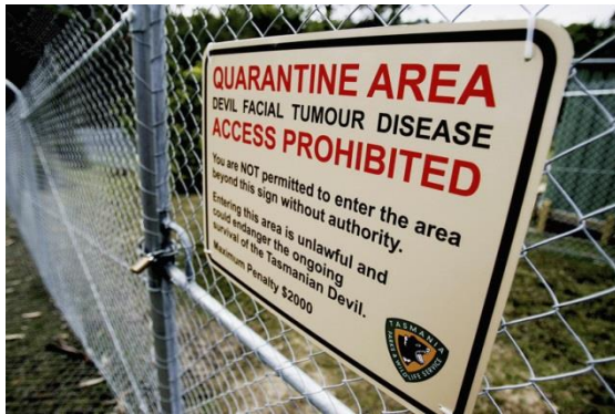
Figure 2. Tasmanian devil quarantine area.

Another project that has not yet entered the construction phase but is quite exciting is the Great Devil Walls Of Tasmania (GDWOP). GDWOP are the plan to build two large sanctuaries in the wild in Tasmania. One of these would separate the Freycinet peninsula from the mainland; the other would separate a part of north western Tasmania. This project is exciting because it would enable larger populations of devils to roam freely in their natural habitat safe from DFTD. Also, a project where a group of devils have been relocated from captivity to Maria Island just outside Tasmania has been put into action. This is another insurance population project which lets the population roam free on the island which is a national park. The population of 15 devils which were relocated to the island was chosen from hundreds of individuals in captivity. The process of choosing them included behavioral tests to make sure the devils acted like wild specimens.