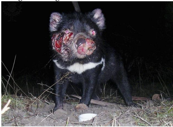
Figure 1. Tasmanian devil with facial tumor's caused by DFTD.

Since 1996 a mysterious epidemic has been sweeping across the island of Tasmania, threatening the Tasmanian devil ( Sarcophilus harrisii ) with extinction. The species is endemic to the island which is part of Australia and lies south of Melbourne. Being endemic to the island the devils are of particular risk of extinction. Not only has the risk of losing the world's largest extant carnivorous marsupial aroused great interest, but also the disease itself, has received much attention from the world of oncology due to its unusual trait of being a contagious cancer.