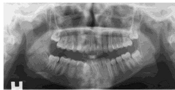
Figure 1 Panoramic radiograph on a patient with JIA with example of common alteration, flattening, on the left TMJ. Right side (H) is normal.

The total pharmacological treatment was evaluated longitudinally from disease onset, established by the rheumatologist, to the time of the panoramic examination. Medication with DMARDs, which included MTX, and/or biologically modifying medications, including tumour necrosis factor alpha inhibitors (TNF-alpha) and/or corticosteroid injections in the TMJ, was denoted “potent medication”. Fifteen patients received corticosteroid injections in the TMJ but only 4 without simultaneous DMARDs and therefore further analyses were not possible. The use of “potent medication” for six