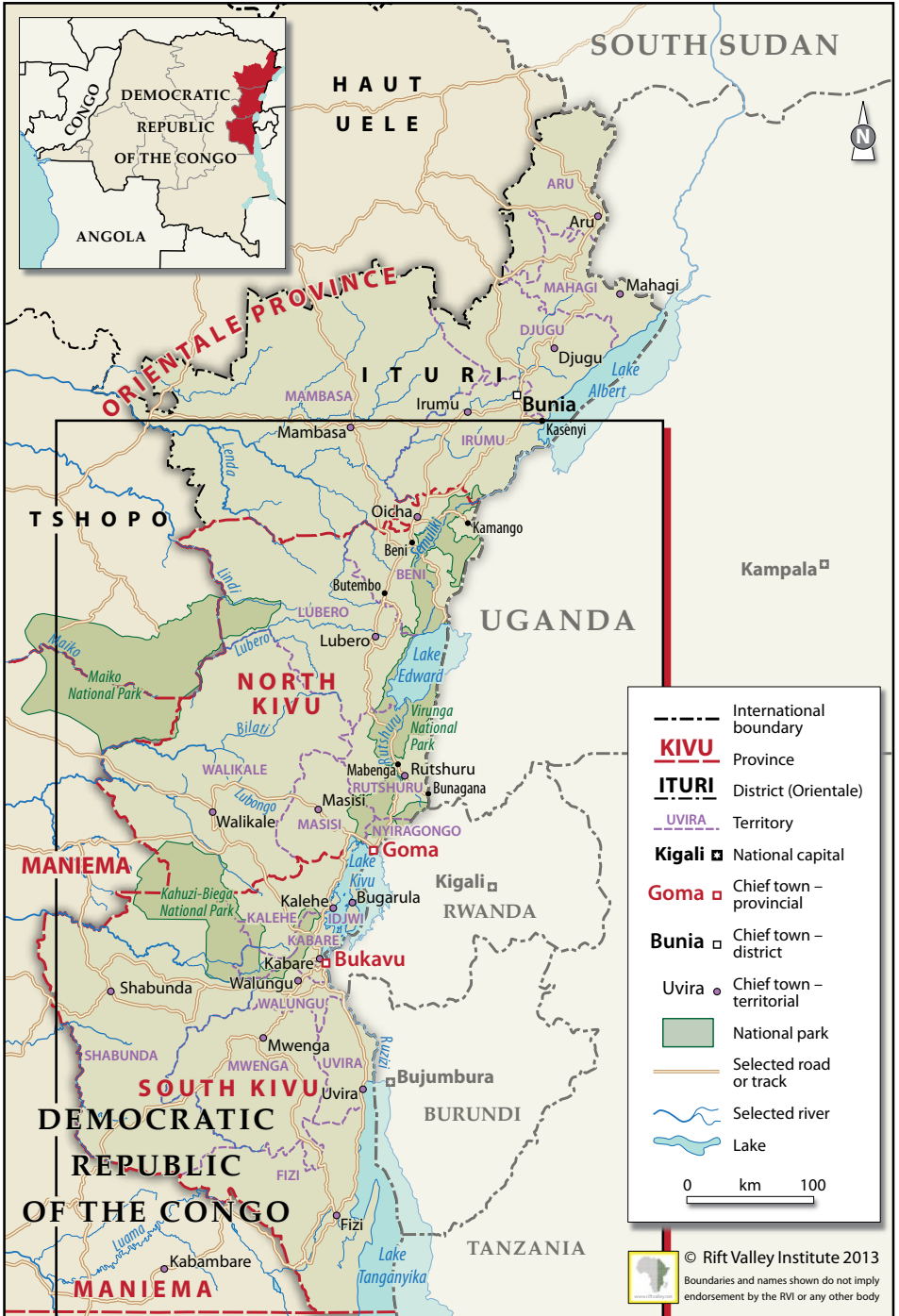
Map 1. The eastern DRC, showing area of detailed map on the following page