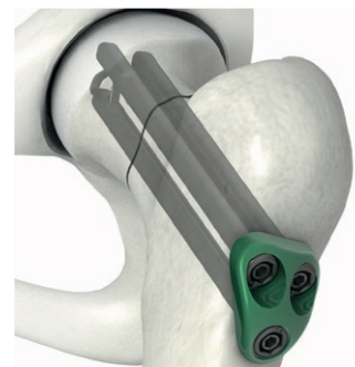
Figure 1. Hansson Pinloc System.

Pinloc (Figure 1) is a development of the commonly used Hansson pins and represents a new concept. Pinloc consists of 3 cylindrical parallel pins with hooks, connected through a fixed angle interlocking plate. The locking plate is not fixed to the femoral cortex, which allows for compression of the fracture along the femoral neck. Biomechanical laboratory studies with composite bone block have shown greater stiffness, torque at failure, and absorbed total energy at failure when fixed with Pinloc compared with 2 Hansson pins (Brattgjerd et al. 2018). Torsional stability is thought to be beneficial for healing of femoral neck fractures (Ragnarsson and Kärrholm 1992) and could possibly mean less pain for the patient and thus facilitate rehabilitation. Additionally, the lateral plate in the Pinloc implant could reduce local soft tissue irritation compared with the use of protruding pins or screw heads,