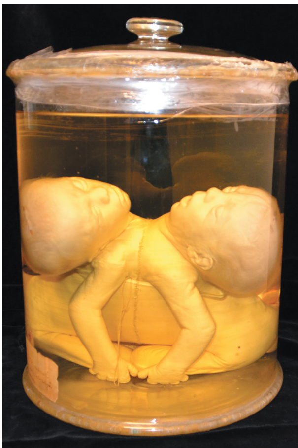
Figure 3. Conjoined newborn twins from the embryological collection at Uppsala University. The bodies were gifted to the Department of Anatomy by Dr. Lindblom in 1896. Museum of Evolution, the wet specimen storage.

The fate of this newborn remains unknown, but some midwives sent malformed newborns to the anatomical department in Uppsala. 113 Those with bodies not considered viable were deeply ambiguous entities. If they were asphyxial, usually no attempts were made to resuscitate them, but if they managed to draw breath by themselves, they were cared for. When they died, conflicting ideas about the disposal could clash – the opposing parties being the female patient and her husband, and the attending medical practitioner. As shown, medical practitioners did sometimes obtain bodies of malformed newborns. But this was not always the case. The female patient and her husband could display them, or have them buried in a cemetery without letting a medical practitioner conduct an autopsy or gain access to the body. 114 Like miscarried fetal bodies at later stages of gestation, the management of deceased malformed newborns was a grey area, which caused uncertainty and opened up space for negotiation. Nonetheless, malformed newborns were referred to as ‘children’.