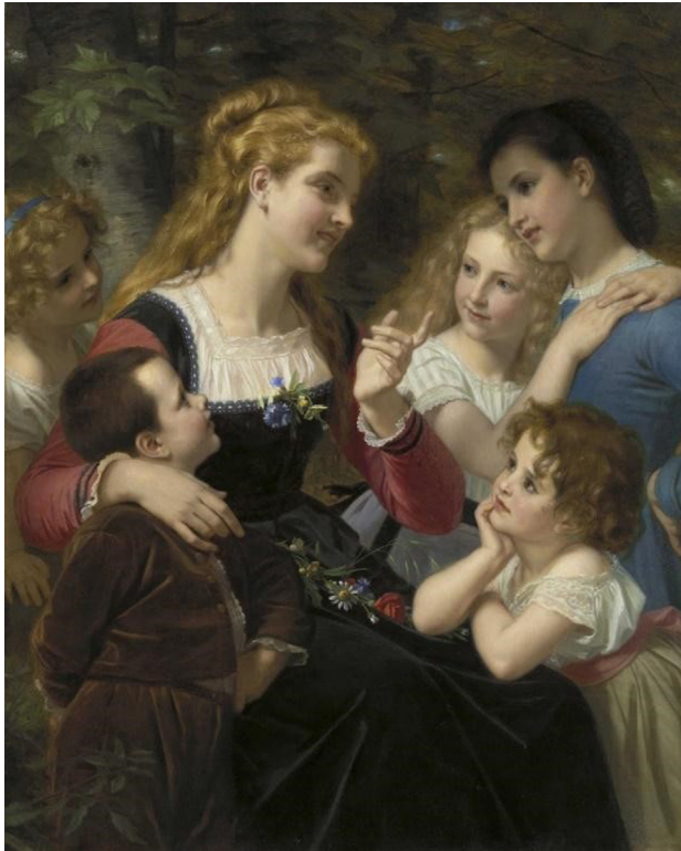
Figure 1. Contes enfantines by Hugues Merle (1823–1881).

developmental cognitive neuroscience literature. Because SA is thought to be tightly linked to ASD, which develops early in childhood, our focus is on developmental data from the first years of life. We also summarize the link, or lack thereof, to ASD early in life for each candidate SA phenotype. Whether a single SA candidate is affected in ASD is not in itself informative for evaluating hypothesis A versus hypothesis B.