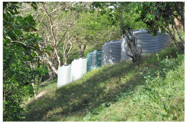
Fig. 2 The five water tanks waiting to be connected to the the village infrastructure

Extreme weather events were identified by most participants as having high potential to affect food production (84%). Participants identified that category 5 tropical cyclone Winston in 2016 was the most severe tropical cyclone they had experienced, and that they worried about the impacts of expected future tropical cyclones. Several farmers believed that flooding had intensified since the pine forests on the hills had been logged between 1980 and 1990. The Ministry of Agriculture has encouraged farmers to refrain from burning and to replant the hills with