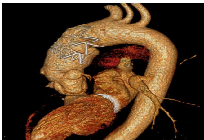
Fig 2. Computed tomography (CT) angiogram after the first thoracic endovascular aortic repair stent.

of nutritional status during that time. Specialist cardiac input from a cardiothoracic surgeon in another center that specializes in complex re-do aortic surgery was also obtained. She was assessed by this surgeon for a second opinion on surgical management. He made a potential operative plan for cardiac salvage surgery with an inpatient mortality risk of over 50%.