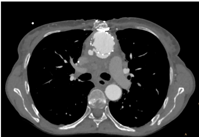
Fig 4. Computed tomography (CT) angiography demonstrating extension of the pseudoaneurysm superior to the stent graft and up to the level of the brachiocephalic trunk. It appeared that the pseudoaneurysm was compressing the carina with a pouch concerning for an abscess developing between the airways.

Aortic surgery involving recurrent disease in the ascending aorta can be challenging to treat. There are several challenges with performing stent graft placement in the ascending aorta including appropriate graft selection, access and customizing the graft delivery system. 14 The normal length of the ascending aorta from the sinotubular junction to the brachiocephalic trunk is between 65 and 87 mm depending on age, hypertension, and measurement method. 15 This excludes the majority of the currently available off-the-shelf stent grafts due to length. However, the Medtronic Navion thoracic stent graft has a working length of 93 mm. Accessing the ascending aorta can also be challenging. In this case, the femoral artery was chosen as the access site,