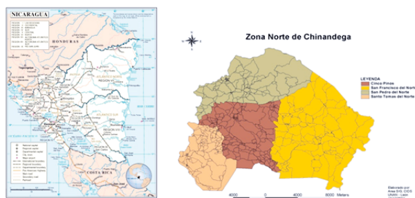
Figure 2. Los Cuatro Santos in north-western Nicaragua

During the last 20 years, community efforts driven by local stakeholders have improved the livelihood in Los Cuatro Santos . Although most of the households still are poor, there has been a reduction in extreme poverty from 19% in 2004 to 14% in 2007, reflecting improvements in water and sanitation, housing quality and an increase in years of schooling in the population (76). In 2007, 45% of the population aged 12 years or more had completed primary school as opposed to 40% in 2004 (76). In addition to improvements in household and educational resources, the under-5 mortality rate has dropped from 24 per 1000 live births in 2004 to 16 per 1000 live births in 2009 (77). In addition to the overall reduction in mortality there has been an improved social equity in child survival when comparing children of mothers with and without formal education (76, 78).